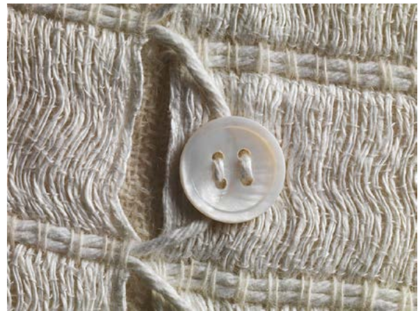
Fig. 5. Detail of the button blanket.

this: ‘I wish you could weave smaller blankets for me. When we lose a child, I never know what to say to the parents. With a blanket in my hand, I could say: “You may wrap your baby in this”’.