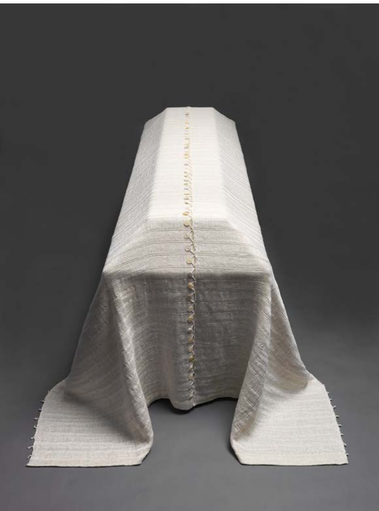
Fig. 4. The button blanket, 2008.