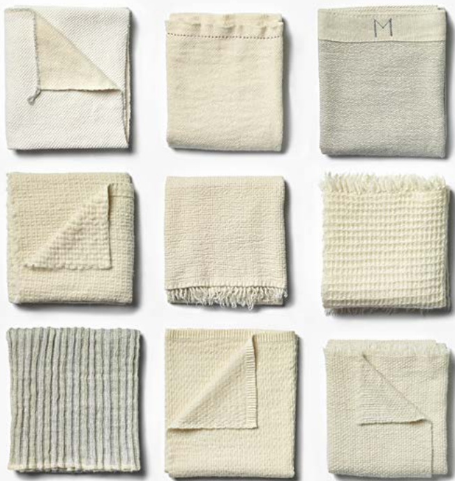
Fig. 6. Infant-wrapping cloth, handwoven, 2011.

of metaphors related to weaving. The prophet Isaiah wrote about death in the following way: